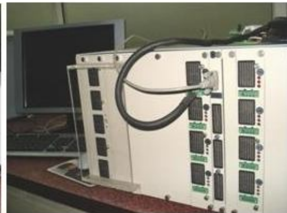
Automatic Battery Tester