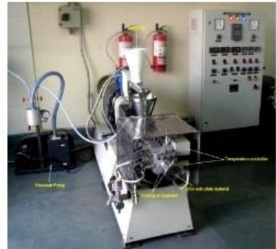
Screw Type Extruder