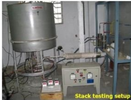
Stack testing setup