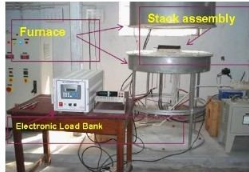
Stack Testing Facility